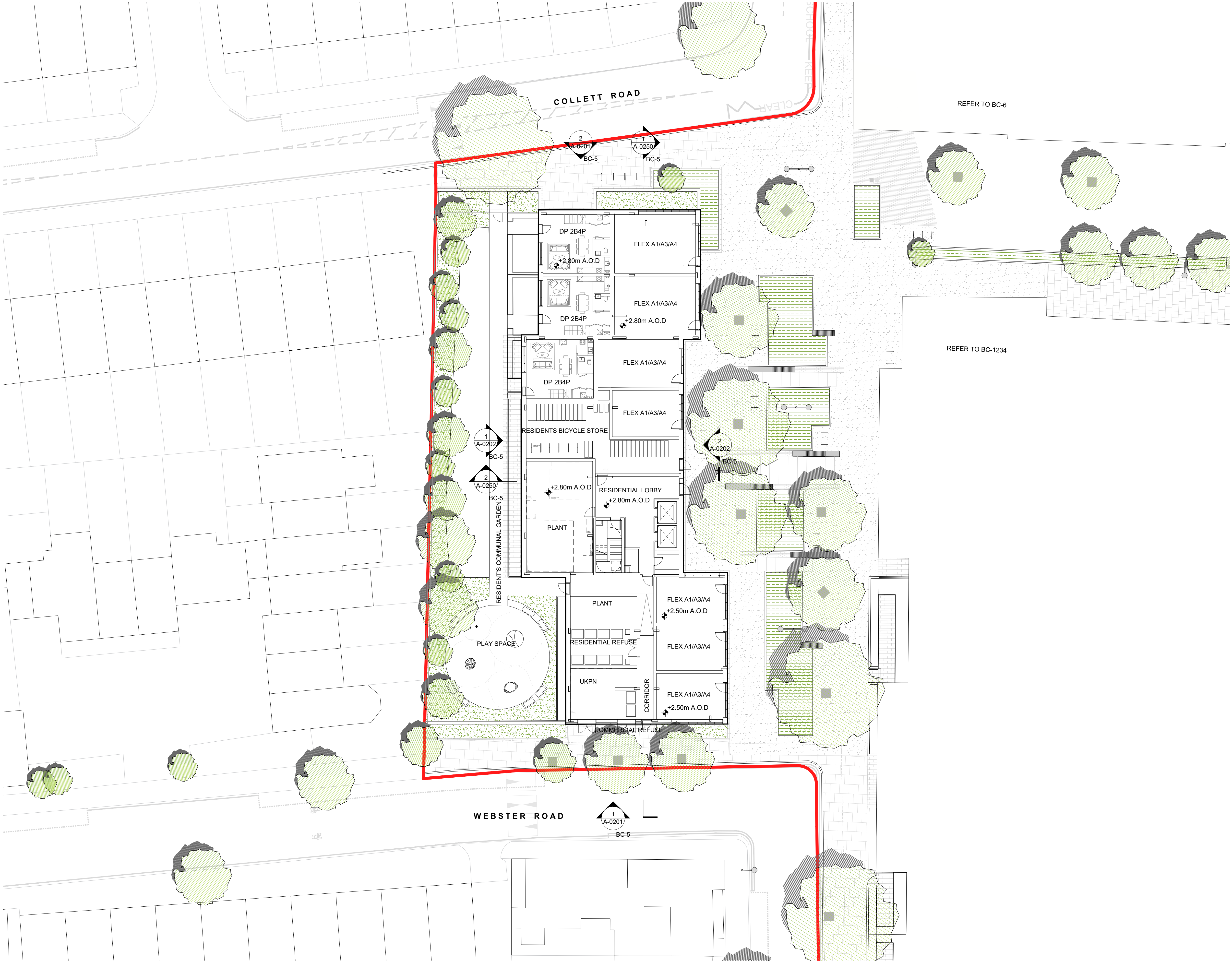
BC-5 GROUND FLOOR PLAN SCALE: 1:200 @ A1

© 2018 KOHN PEDERSEN FOX ASSOCIATES (INTERNATIONAL) PA. All rights reserved. Where drawing contains Ordnance Survey data © Crown Copyright. Licence no. 10001998.