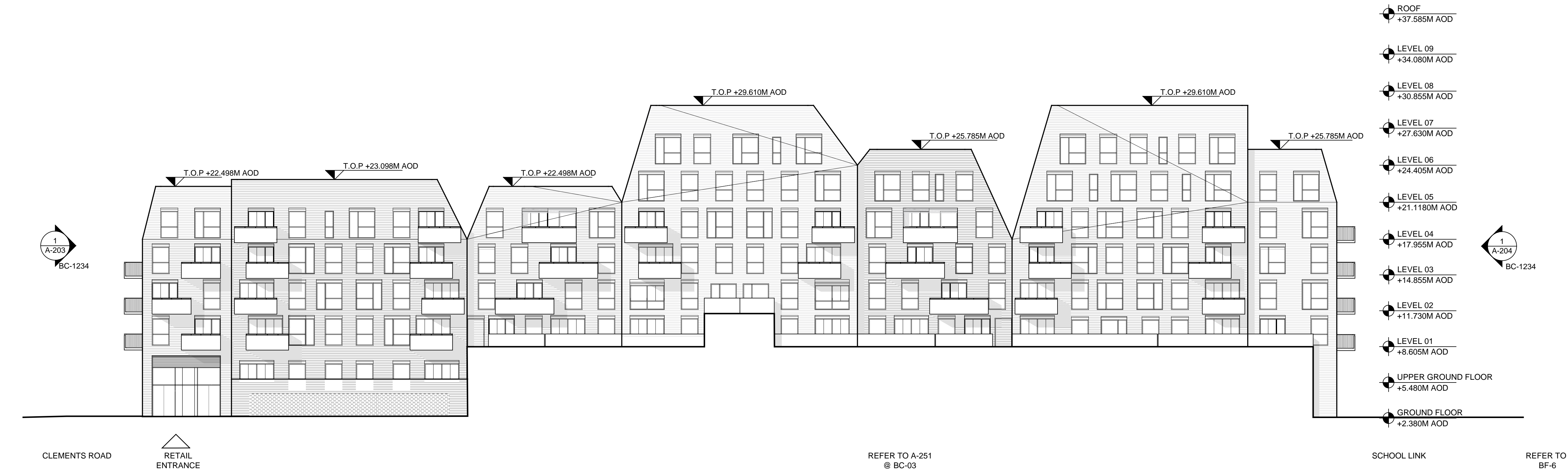
1 BC-1234 EAST INTERNAL ELEVATION SCALE: 1:200 @ A1

Filename: H:\2607_Project\Sunbeam\Drawings\CAD\Sheet\2607-KPF-BC03-XX-DR-ELE-A-0206.dwg Plotted by: Shop, Magdalena Plot Time: 5/31/2018 7:24 PM