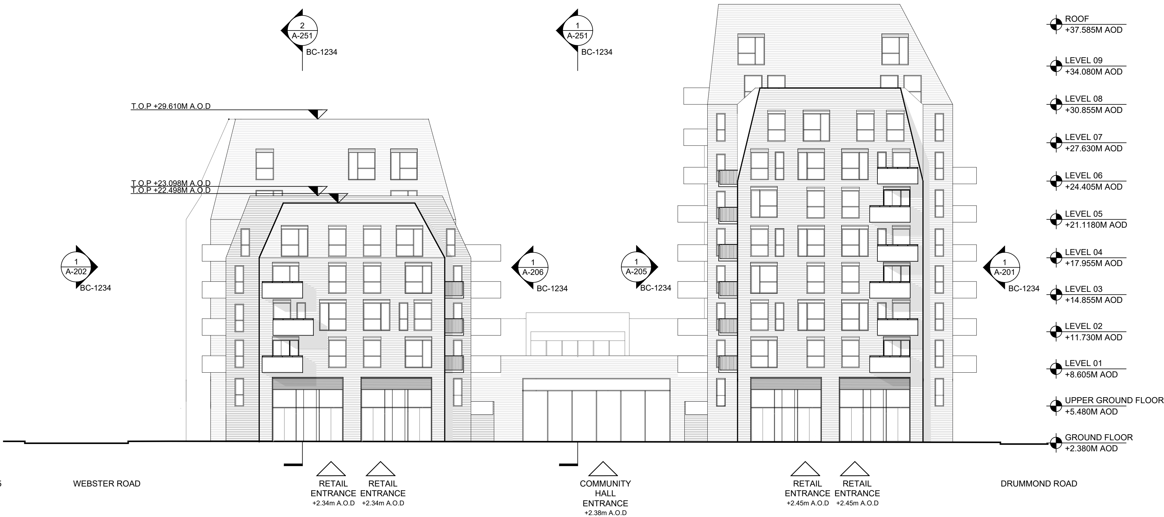
BC-1234 SOUTH ELEVATION SCALE: 1:200 @ A1

Structural Engineer (Building F) AKT II Tel: 207 250 7777