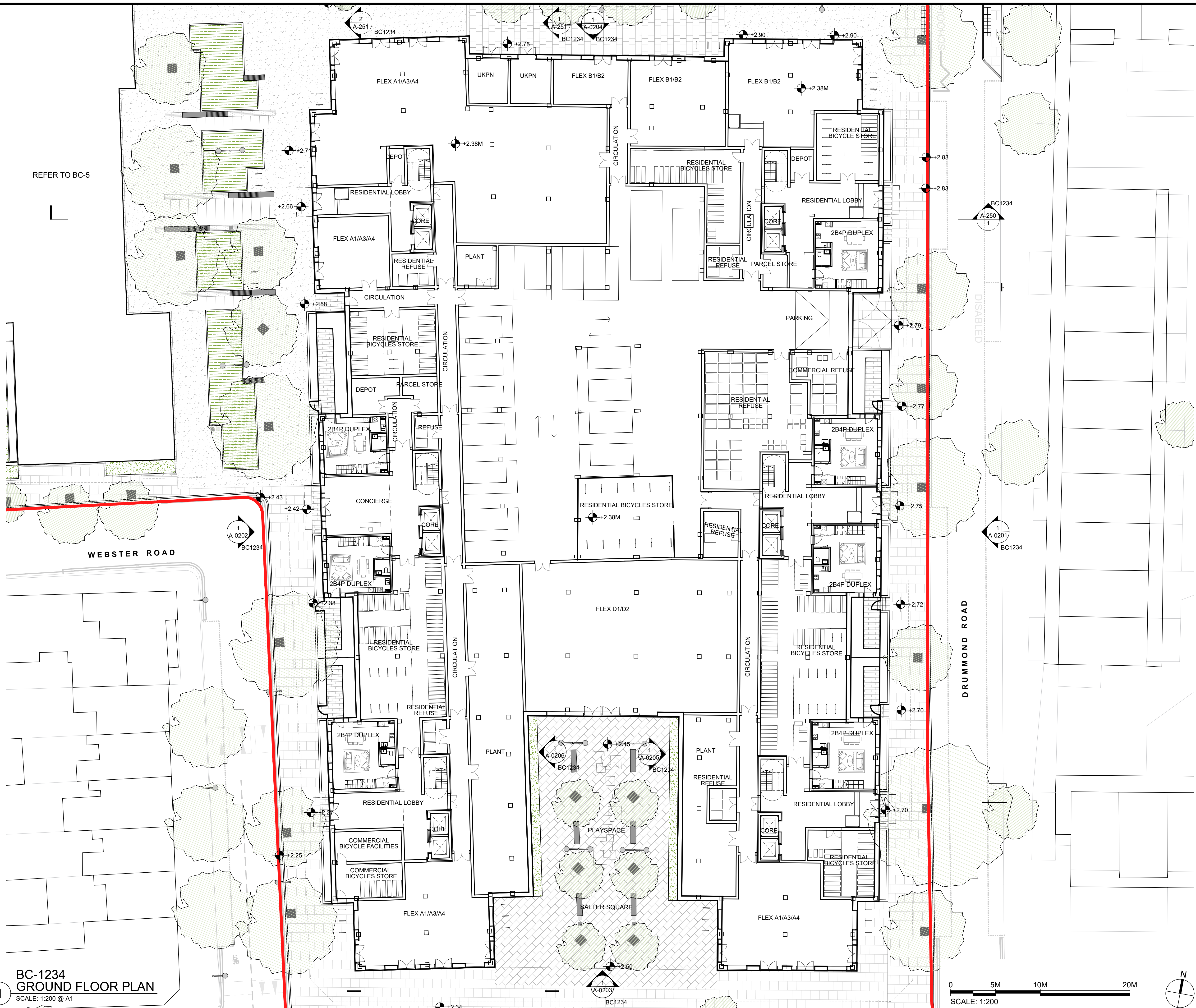
BC-1234 GROUND FLOOR PLAN SCALE: 1:200 @ A1