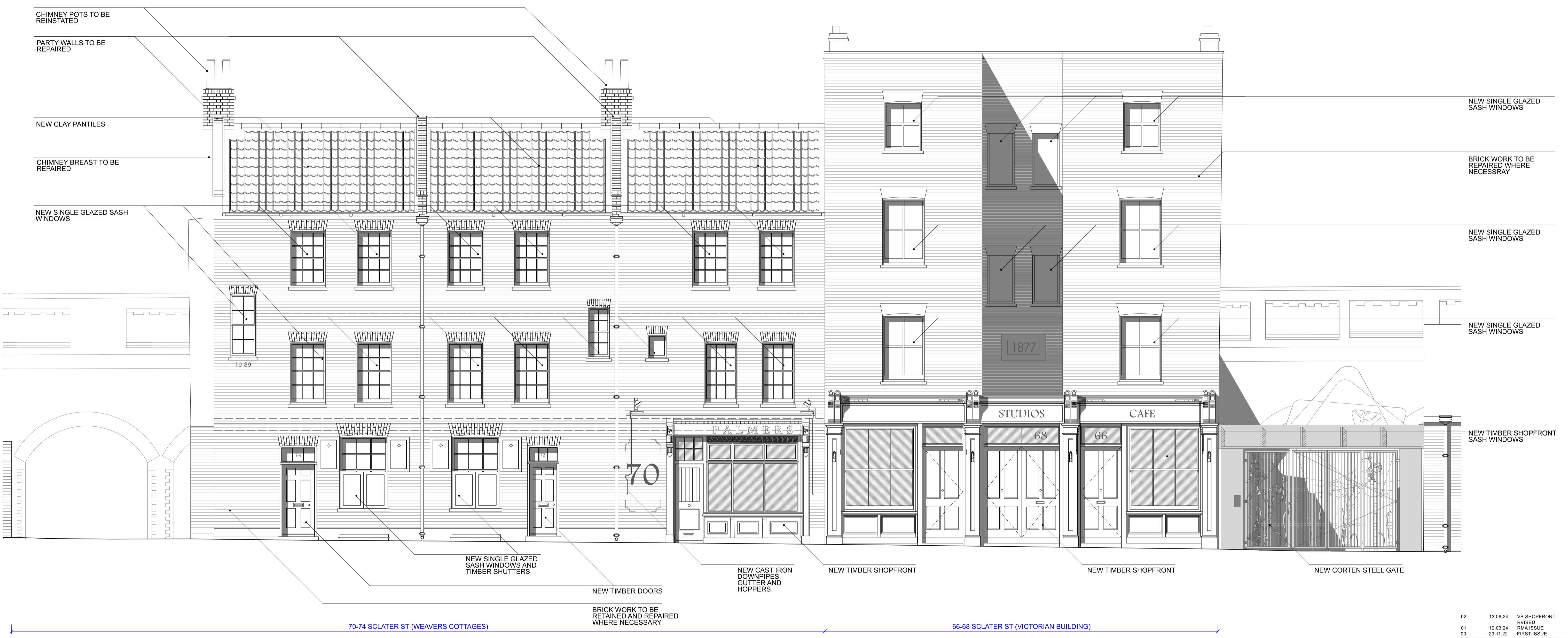
1 1:50 @ A1 / 1:100 @ A3 PROPOSED FRONT ELEVATION

This drawing is protected by copyright and must not be copied or reproduced without the written consent of Chris Dyson Architects LLP. All dimensions and sizes to be checked on site. North points shown are indicative. Do not scale off this drawing except for planning purposes. Dimensions, area and levels are only approximate and subject to site survey. All dimensions to be checked on site. Any discrepancies or variations to be reported to the architect before work commences. This drawing to be read in conjunction with the specification, where provided, and all relevant consultants drawings and / or specialist drawings / documents and any discrepancies or variations to be reported to the architect before the affected work commences.