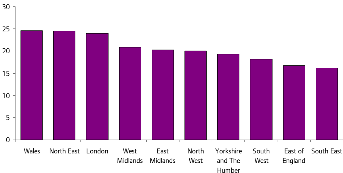
Chart 1: Median Percentage of Households in Income Poverty, 2007/08.