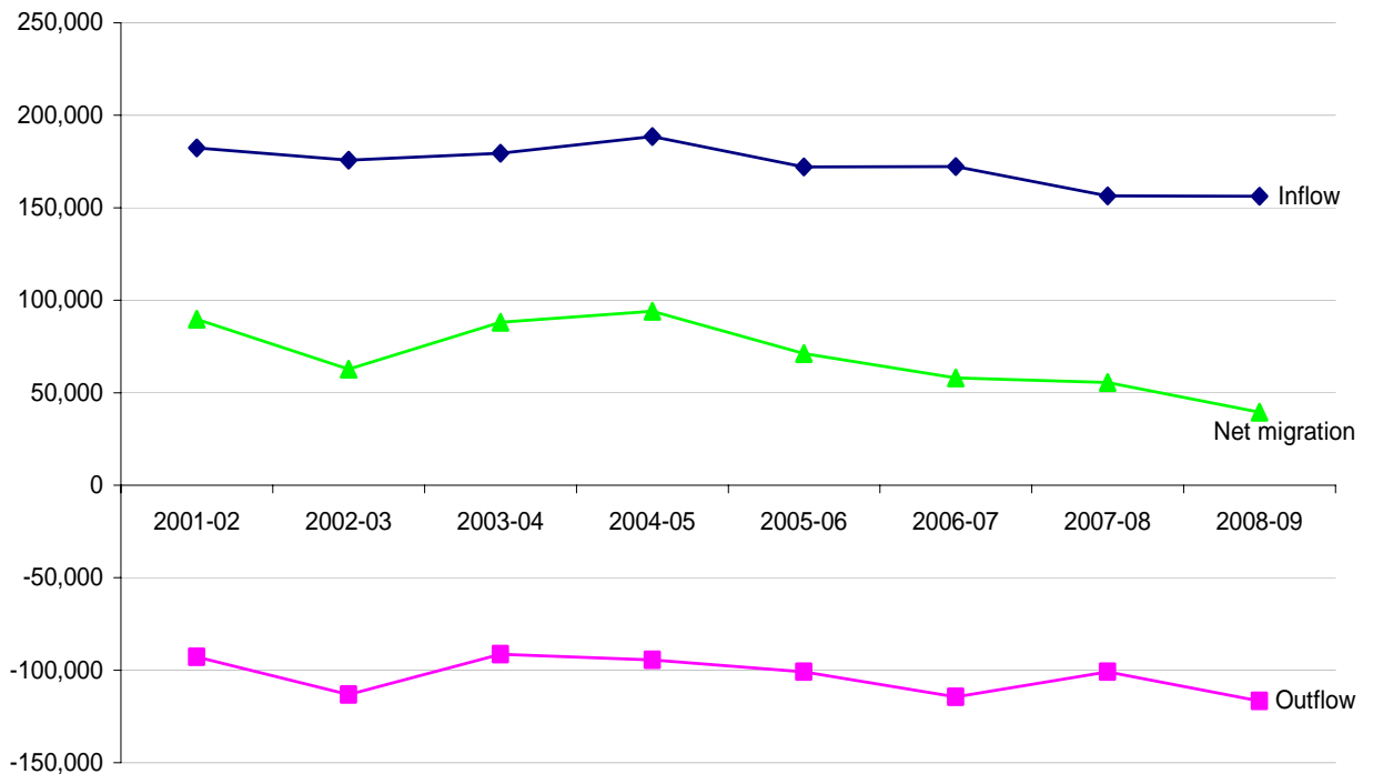
Figure 2: International migration flows, Greater London, 2001-02 to 2008-09

Figure 2 shows that between in 2008-09 there was an increased outflow from London to overseas, compared with 2007-08, of 16 thousand resulting in a decrease in the net international migration to London to 39.6 thousand, the lowest level since mid-1995.