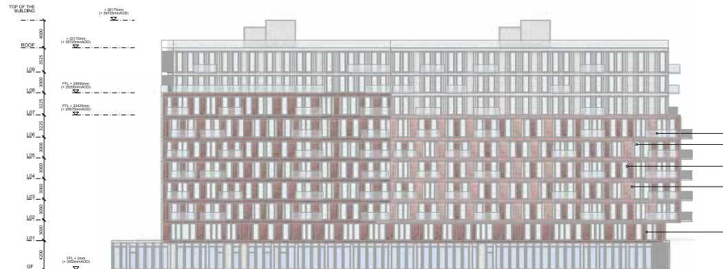
04 West Elevation Building KL

This drawing is copyright. Do not scale off dimensions. All dimensions to be checked on site by contractor. Contractor to report any dimensional discrepancies, errors or omissions prior to commencing on site.