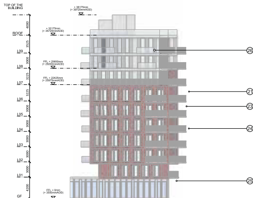
03 South Elevation Building KL