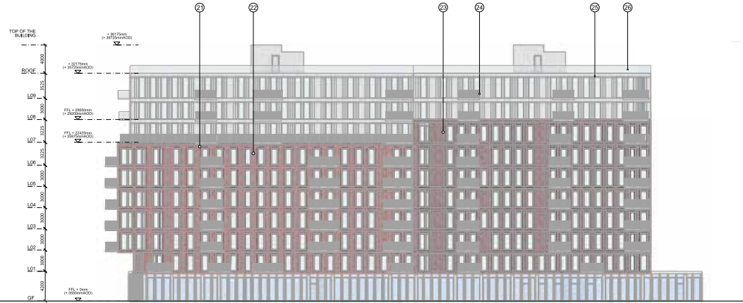
02 East Elevation Building KL