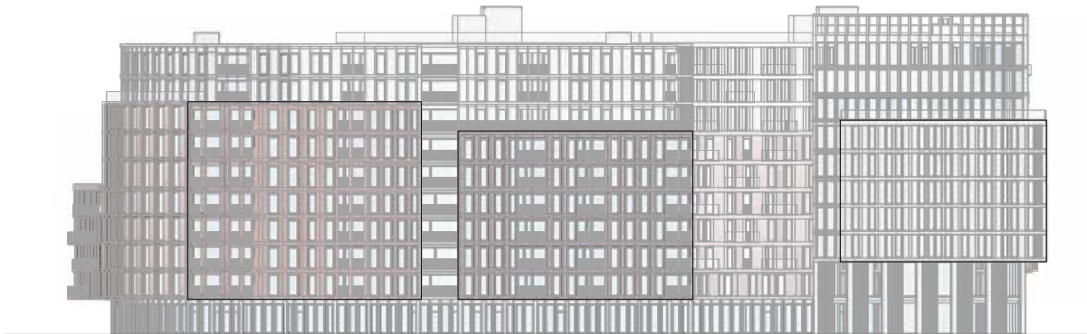
02 West Elevation Plot B

This drawing is copyright Do not scale off dimensions. All dimensions to be checked on site by contractor. Contractor to report any dimensional discrepancies, errors or omissions prior to commencing on site.