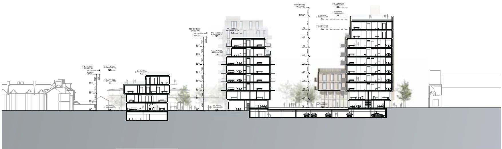
01 Cross Section Plot A