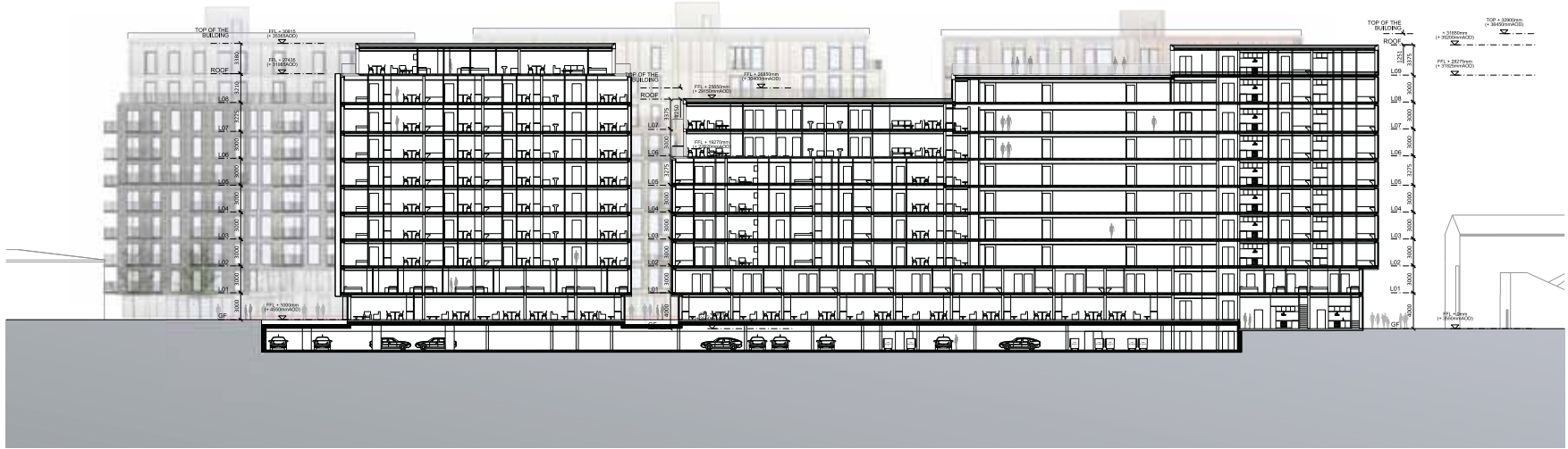
02 Longitudinal Section Plot A

This drawing is copyright Do not scale off dimensions. All dimensions to be checked on site by contractor. Contractor to report any dimensional discrepancies, errors or omissions prior to commencing on site.