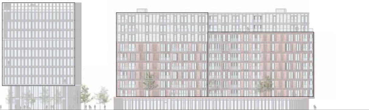
02 Site Internal Elevation Plot B

This drawing is copyright Do not scale off dimensions. All dimensions to be checked on site by contractor. Contractor to report any dimensional discrepancies, errors or omissions prior to commencing on site.