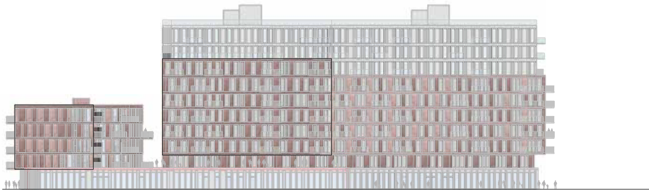
01 Site Internal Elevation Plot B