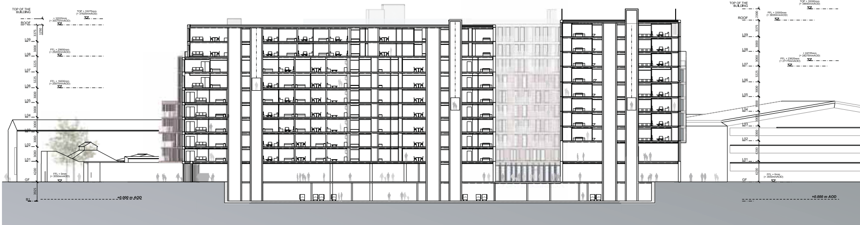
02 Longitudinal Section Plot B

This drawing is copyright. Do not scale off dimensions. All dimensions to be checked on site by contractor. Contractor to report any dimensional discrepancies, errors or omissions prior to commencing on site.