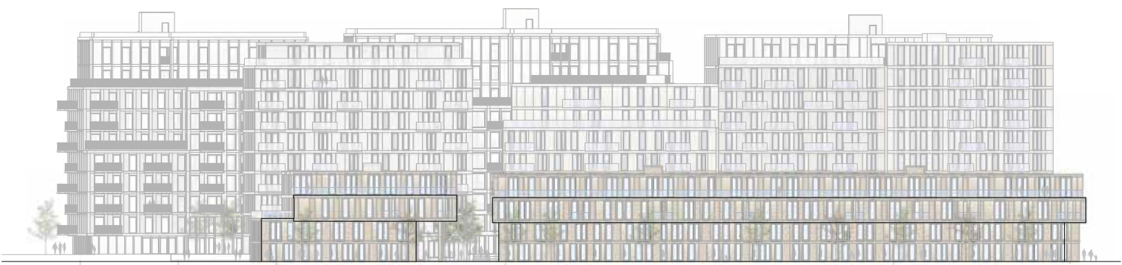
02 West Elevation Plot A