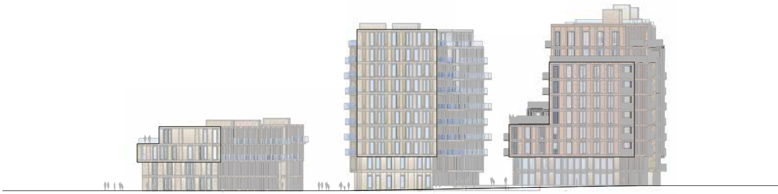
01 South Elevation Plot A