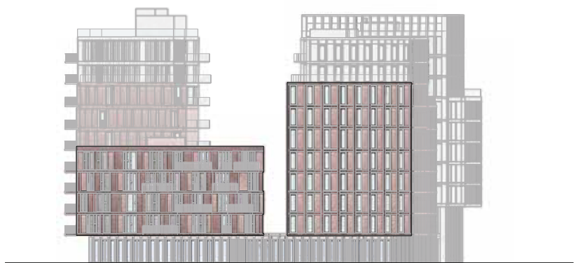
01 North Elevation Plot B