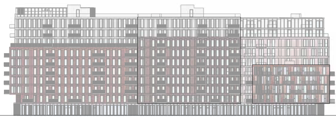
02 East Elevation Plot B

This drawing is copyright Do not scale off dimensions. All dimensions to be checked on site by contractor. Contractor to report any dimensional discrepancies, errors or omissions prior to commencing on site.