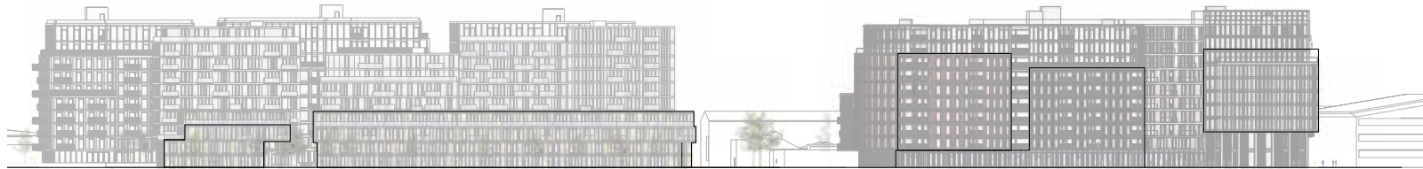
01 Site West Elevation Plot A & Plot B