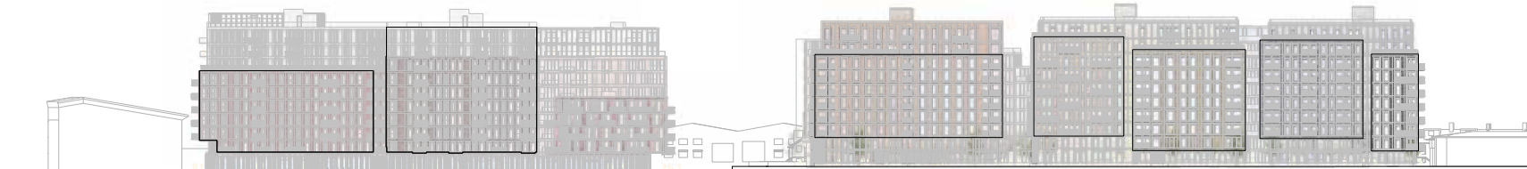
02 Site East Elevation Plot A & Plot B

This drawing is copyright. Do not scale off dimensions. All dimensions to be checked on site by contractor. Contractor to report any dimensional discrepancies, errors or omissions prior to commencing on site.