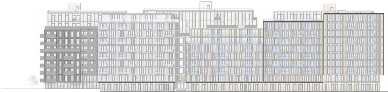
01 Internal Site Elevation Plot A