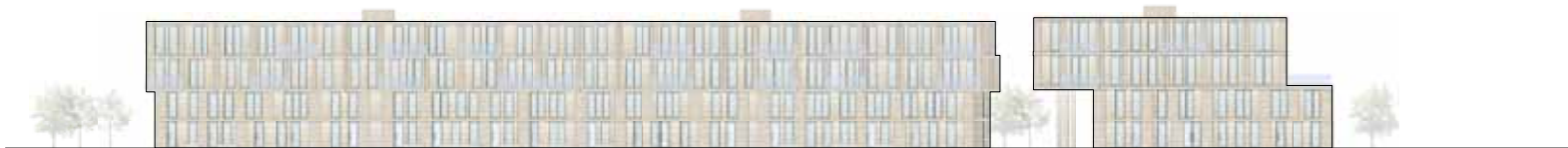
02 Internal Site Elevation Plot A

This drawing is copyright Do not scale off dimensions. All dimensions to be checked on site by contractor. Contractor to report any dimensional discrepancies, errors or omissions prior to commencing on site.