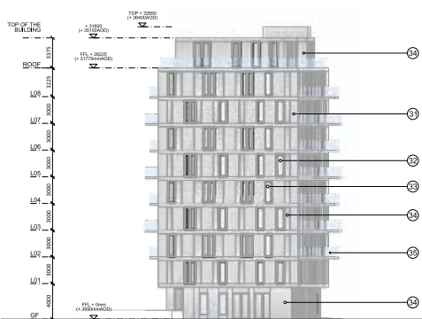
01 North Elevation Building D