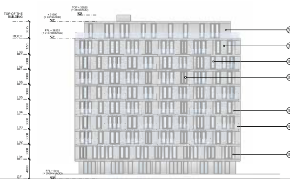
02 East Elevation Building D