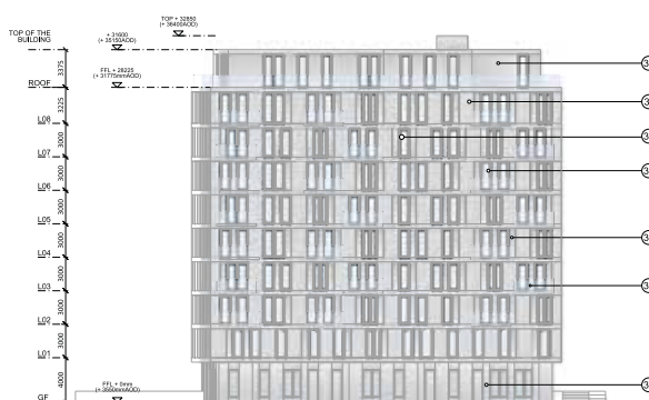
04 West Elevation Building D

This drawing is copyright Do not scale off dimensions. All dimensions to be checked on site by contractor. Contractor to report any dimensional discrepancies, errors or omissions prior to commencing on site.