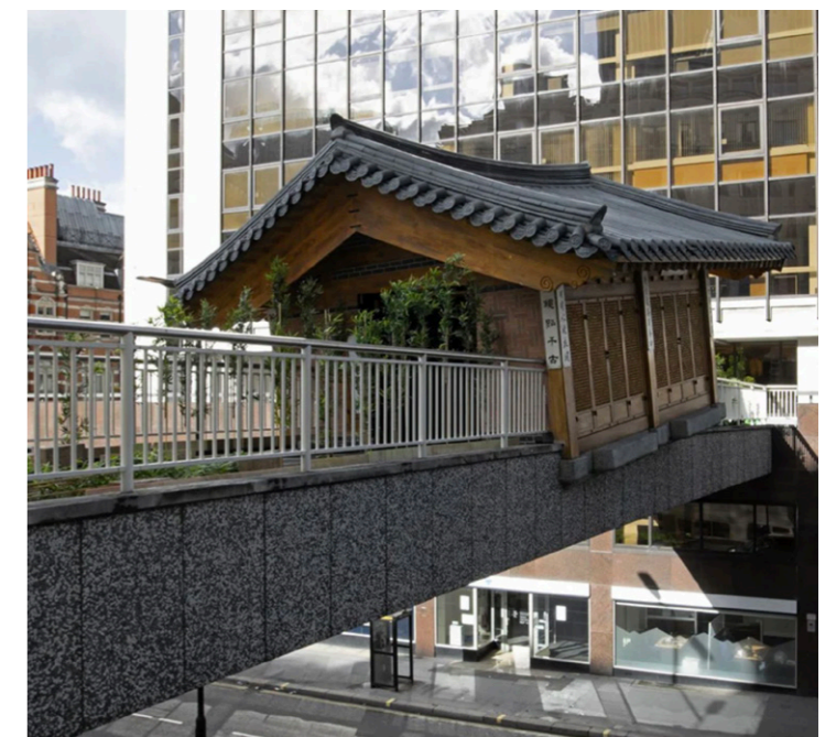
Selection of public art in a range of mediums and styles