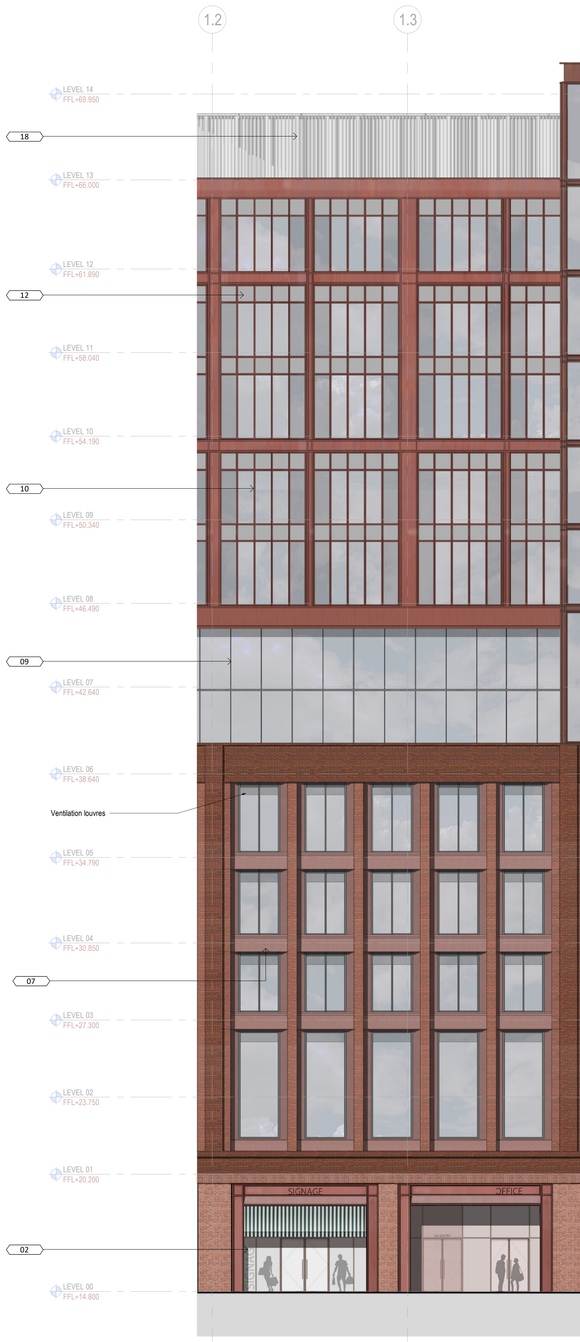
1 SOUTH ELEVATION BAY STUDY 1 1T0100 SCALE: 1 : 100