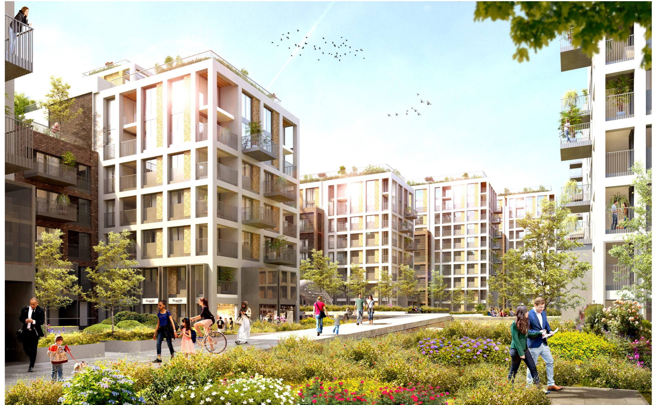
VIEW TOWARDS THE CENTRAL SPACES FROM THE NORTH ENTRY