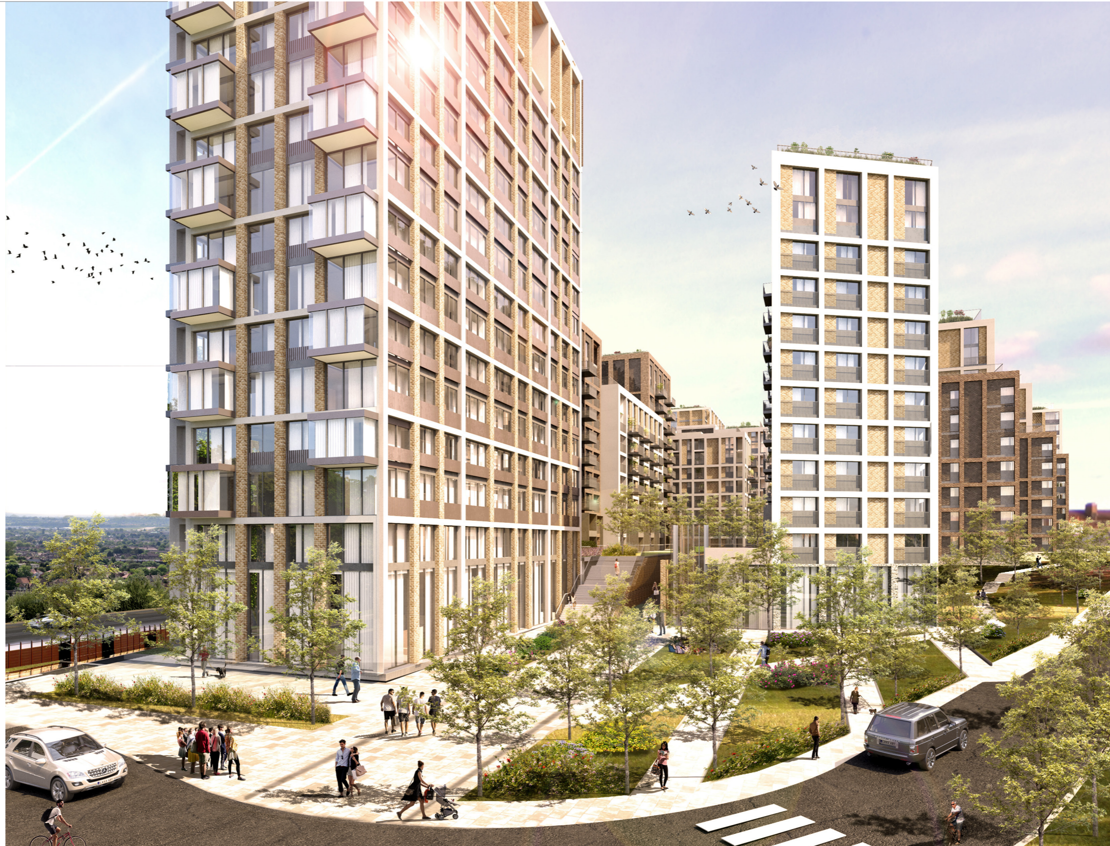
MILL HILL WALK CONNECTS THE SOUTHERN CARPARK AND RETAIL SPACES WITH THE CENTRAL COURTYARD SPACES