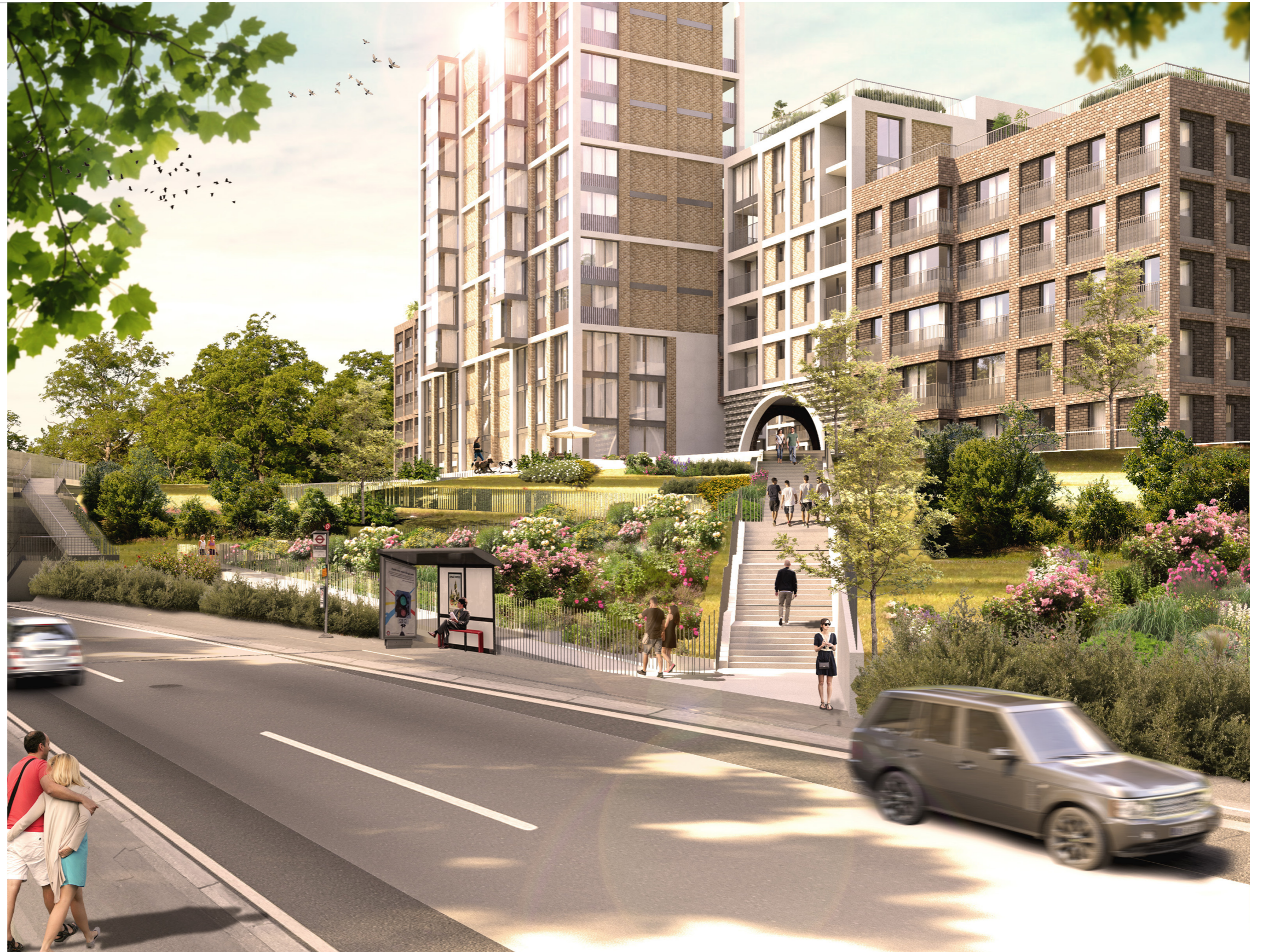
VIEW OF BUNNS LANE TERRACES AND PEDESTRIAN LINK TO NEW PENTAVIA RESIDENTIAL SCHEME