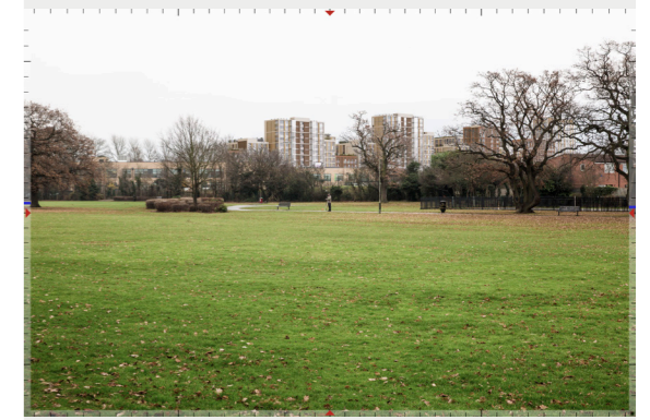
Woodcroft Park | West Corner | Winter - Proposed+consents 3508_1206 version 190321