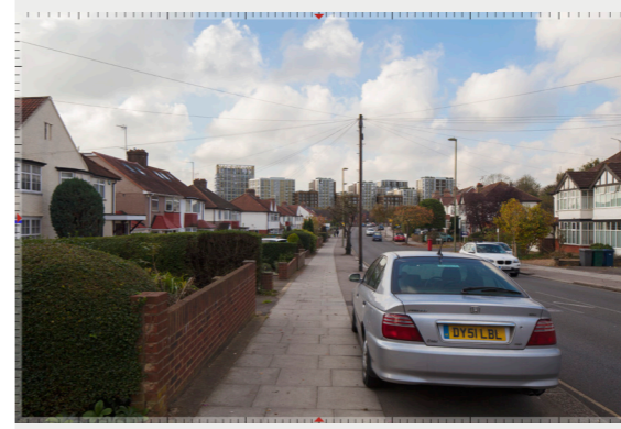
Bunns Lane - outside number 39 - Proposed 3508_7405 version 190319