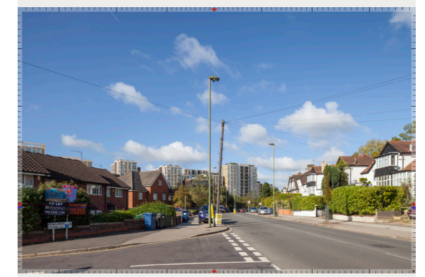
Bunns Lane at Rowlands Close - Proposed+consents 3508_5406 version 190321