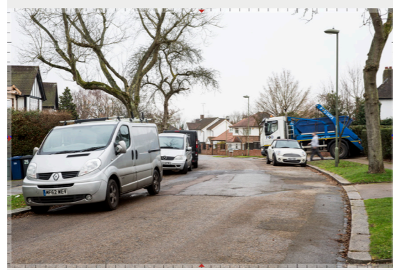
Parkside | Winter - Existing 3508_1101 version 190321