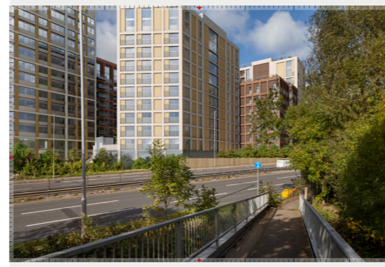
Barnet By-Pass at Watford Way footpath - Proposed+consents 3508_5306 version 190321