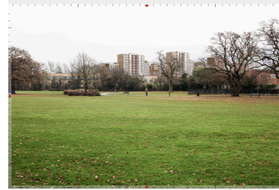
Woodcroft Park | West Corner | Winter - Proposed 3508_1205 version 190321