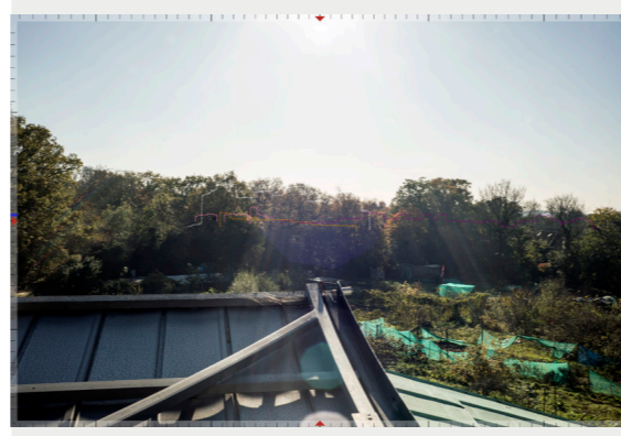
UCL Observatory - Proposed+consents 3508_7516 version 190315