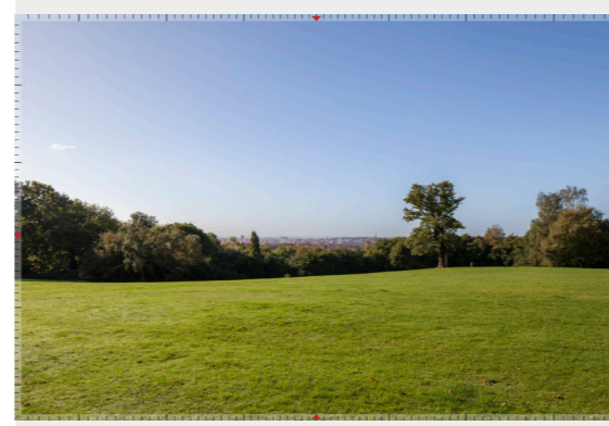
The Mill Field looking south west - Proposed+consents 3508_7006 version 190315