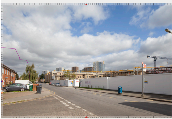
Corner Mead at Long Mead - Proposed+consents 3508_6006 version 190319