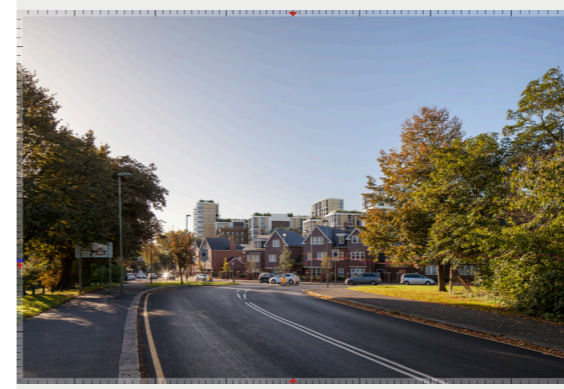
Flower Lane before junction with Bunn's lane - Proposed+consents 3508_5106 version 190319