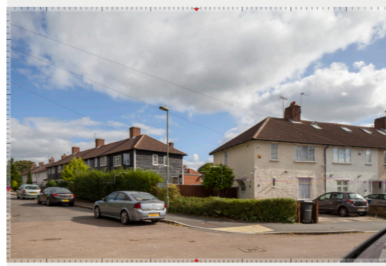
Goldbeaters Grove at Storksmead Road - Proposed+consents 3508_7306 version 190315