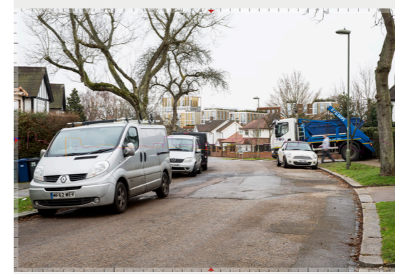
Parkside | Winter - Proposed+consents 3508_1106 version 190321