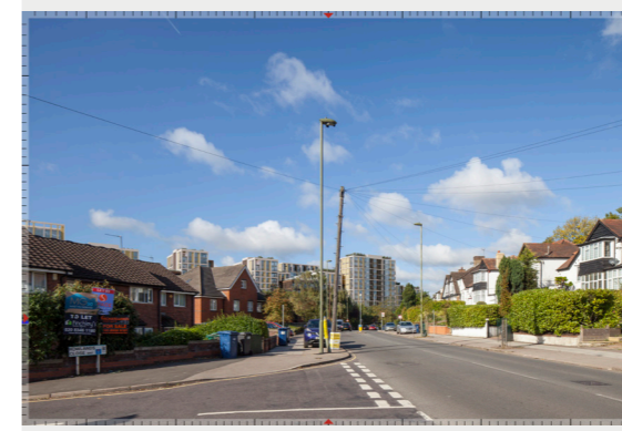
Bunns Lane at Rowlands Close - Proposed 3508_5405 version 190321