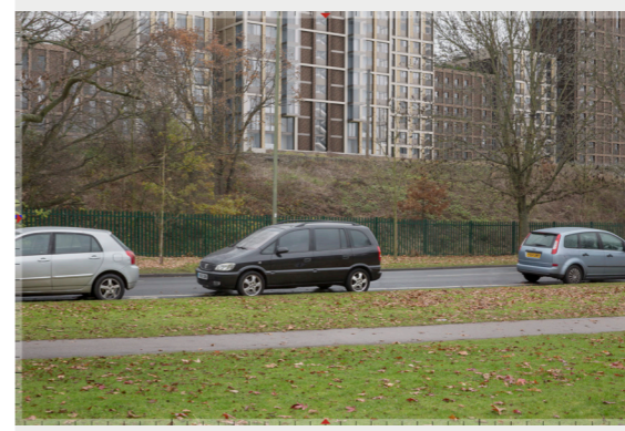
Grahame Park Way | Winter - Proposed+consents 3508_1506 version 190321