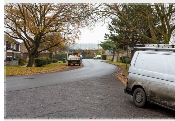
Junction Field Mead | Dunn Mead | Winter - Existing 3508_1401 version 190321