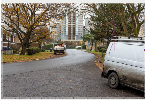
Junction Field Mead | Dunn Mead | Winter - Proposed+consents 3508_1406 version 190321