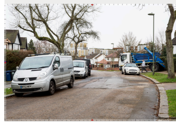
Parkside | Winter - Proposed 3508_1105 version 190321