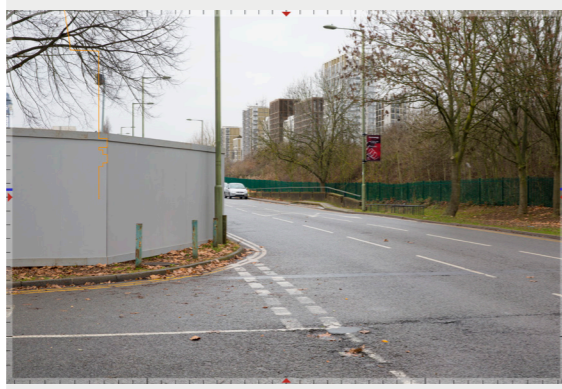
Grahame Park Way | Corner Mead | Winter - Proposed+consents 3508_1306 version 190321