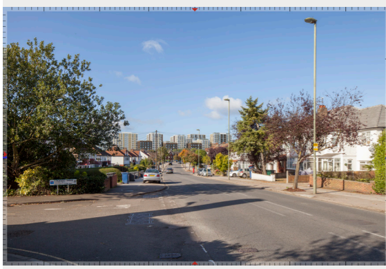
Bunns Lane outside Laing - Proposed 3508_5505 version 190321