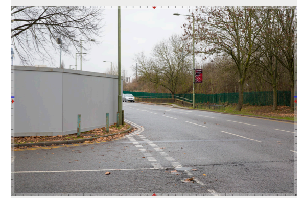
Grahame Park Way | Corner Mead | Winter - Existing 3508_1301 version 190321