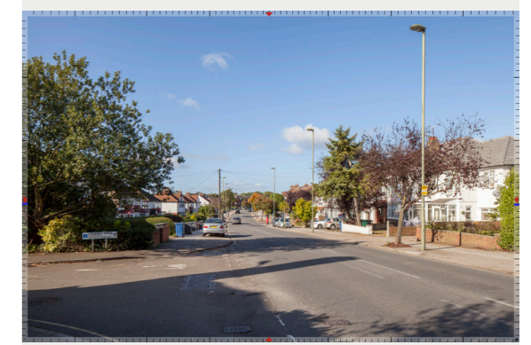
Bunns Lane outside Laing - Existing 3508_5501 version 171020