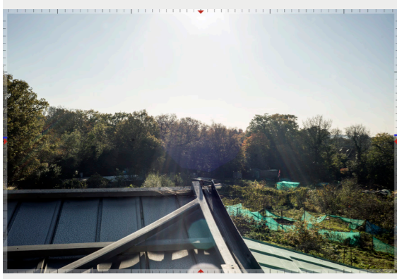
UCL Observatory - Existing 3508_7511 version 171211