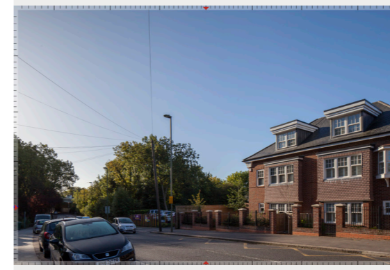
Bunns Lane opposite 93 - Existing 3508_5201 version 171211