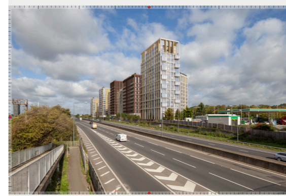
Pedestrian Cross Over West Side - Proposed+consents 3508_5906 version 190321