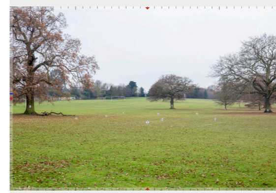
Mill Hill Park | Winter - Existing 3508_1001 version 190321