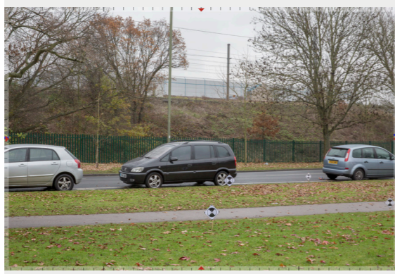
Grahame Park Way | Winter - Existing 3508_1501 version 190321