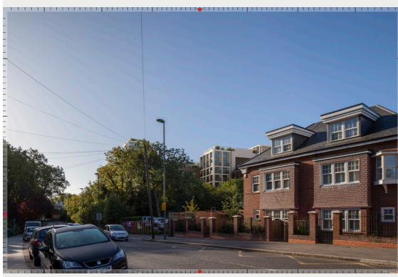
Bunn's Lane opposite 93 - Proposed+consents 3508_5206 version 190319