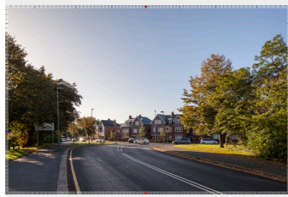
Flower Lane before junction with Bunn's lane - Existing 3508_5101 version 171211