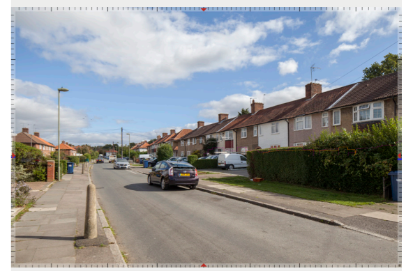
Blundell Road Outside 73 - Proposed+consents 3508_7206 version 190315