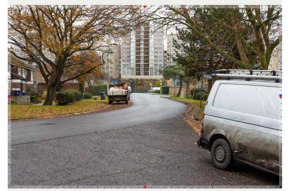
Junction Field Mead | Dunn Mead | Winter - Proposed 3508_1405 version 190321