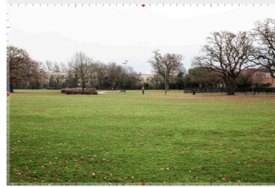
Woodcroft Park | West Corner | Winter - Existing 3508_1201 version 190321