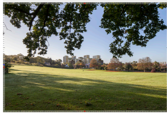
Mill Hill Park at Flower Lane entrance - Proposed+consents 3508_5006 version 190321