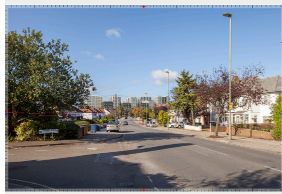
Bunns Lane outside Laing - Proposed+consents 3508_5506 version 190321