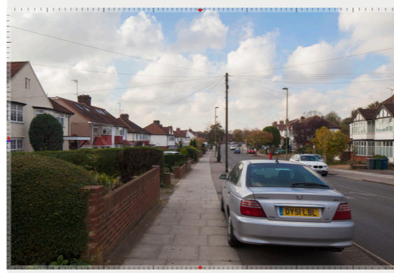
Bunns Lane - outside number 39 - Existing 3508_7401 version 190321