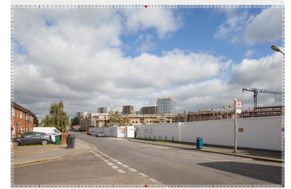
Corner Mead at Long Mead - Proposed 3508_6005 version 190319