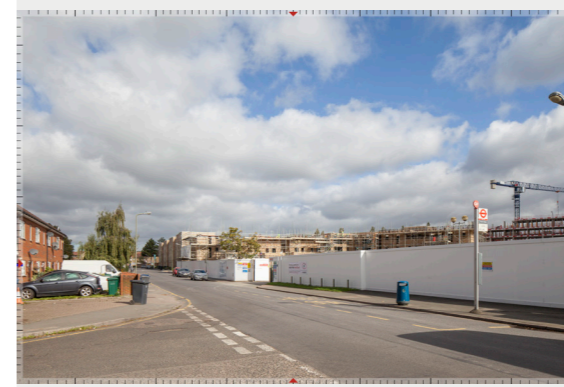
Corner Mead at Long Mead - Existing 3508_6001 version 171211