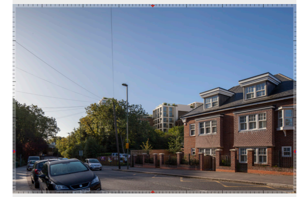
Bunns Lane opposite 93 - Proposed 3508_5205 version 190319