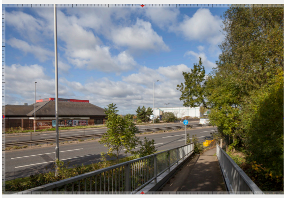
Barnet By-Pass at Watford Way footpath - Existing 3508_5301 version 171211