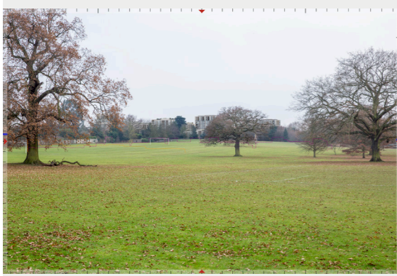
Mill Hill Park | Winter - Proposed+consents 3508_1006 version 190321