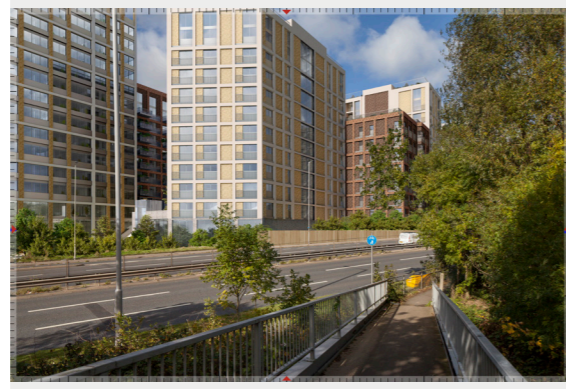
Barnet By-Pass at Watford Way footpath - Proposed 3508_5305 version 190321