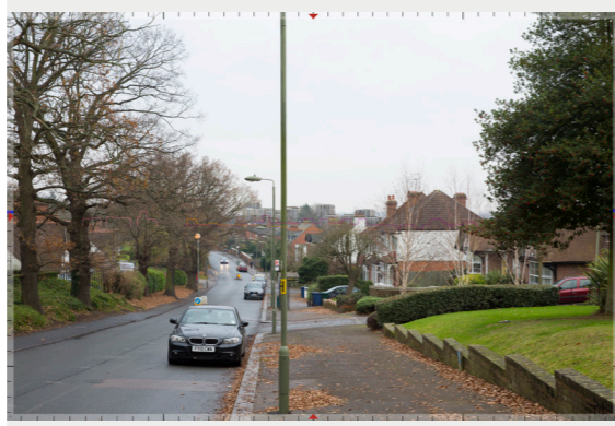
Hammers Lane | Opposite Mill Hill Place | Winter - Proposed+consents 3508_1606 version 190321