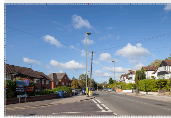
Bunns Lane at Rowlands Close - Existing 3508_5401 version 171211