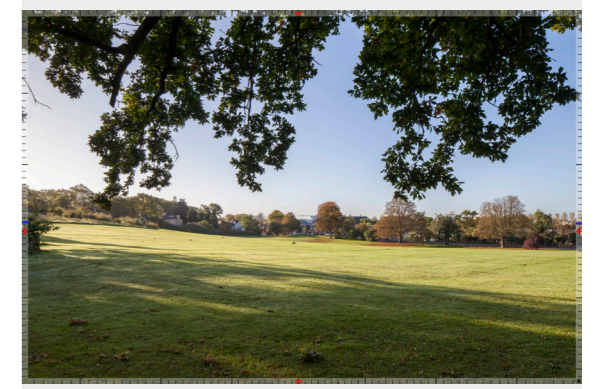
Mill Hill Park at Flower Lane entrance - Existing 3508_5001 version 171020