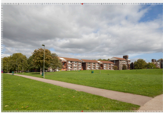
Grahame Park Youth Centre - Existing 3508_7101 version 171211