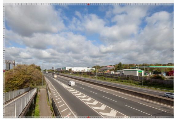
Pedestrian Cross Over West Side - Existing 3508_5901 version 171020