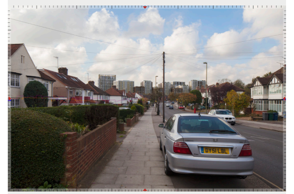
Bunns Lane - outside number 39 - Proposed+consents 3508_7406 version 190319