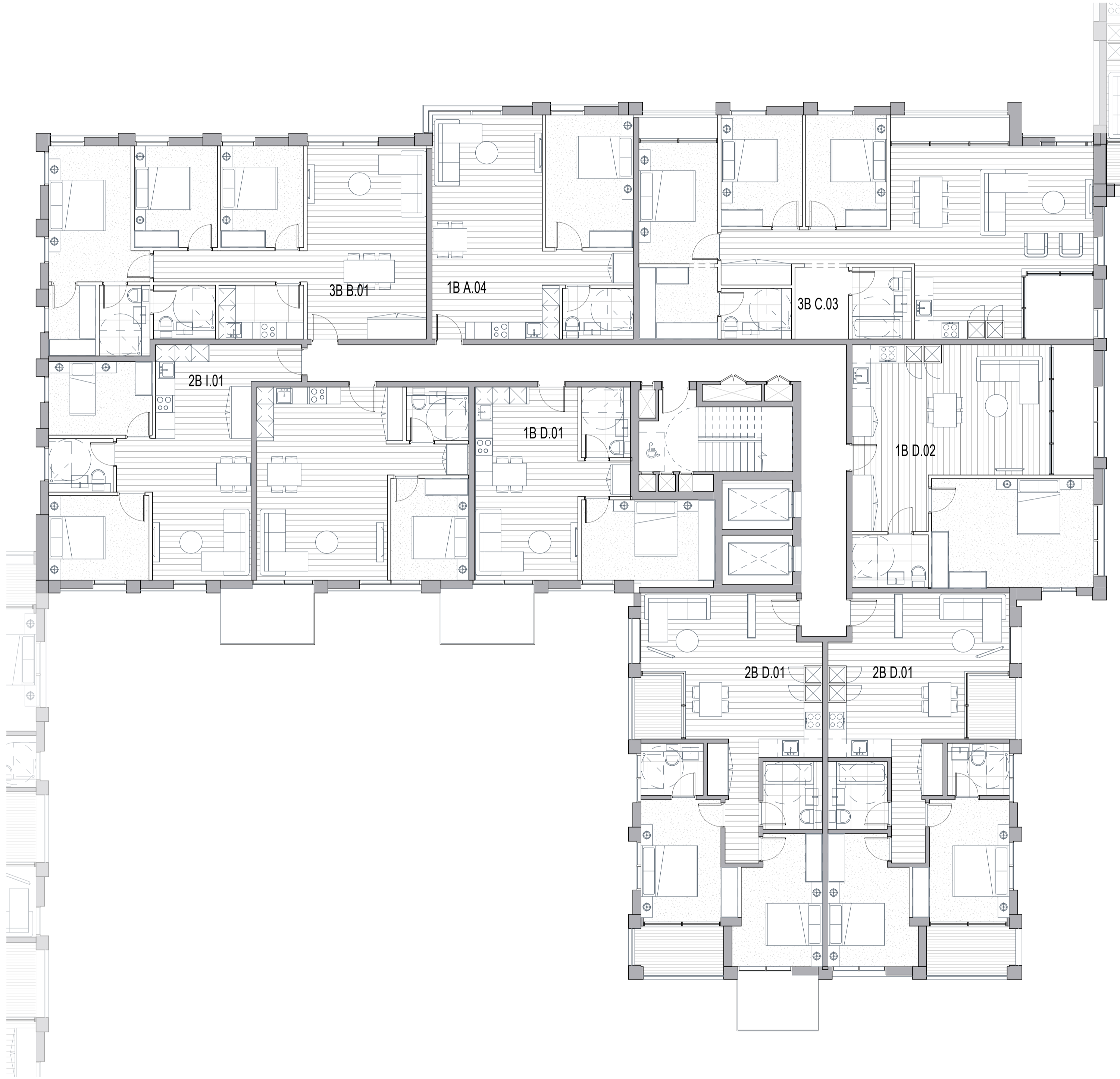
PR-L.03 Block M