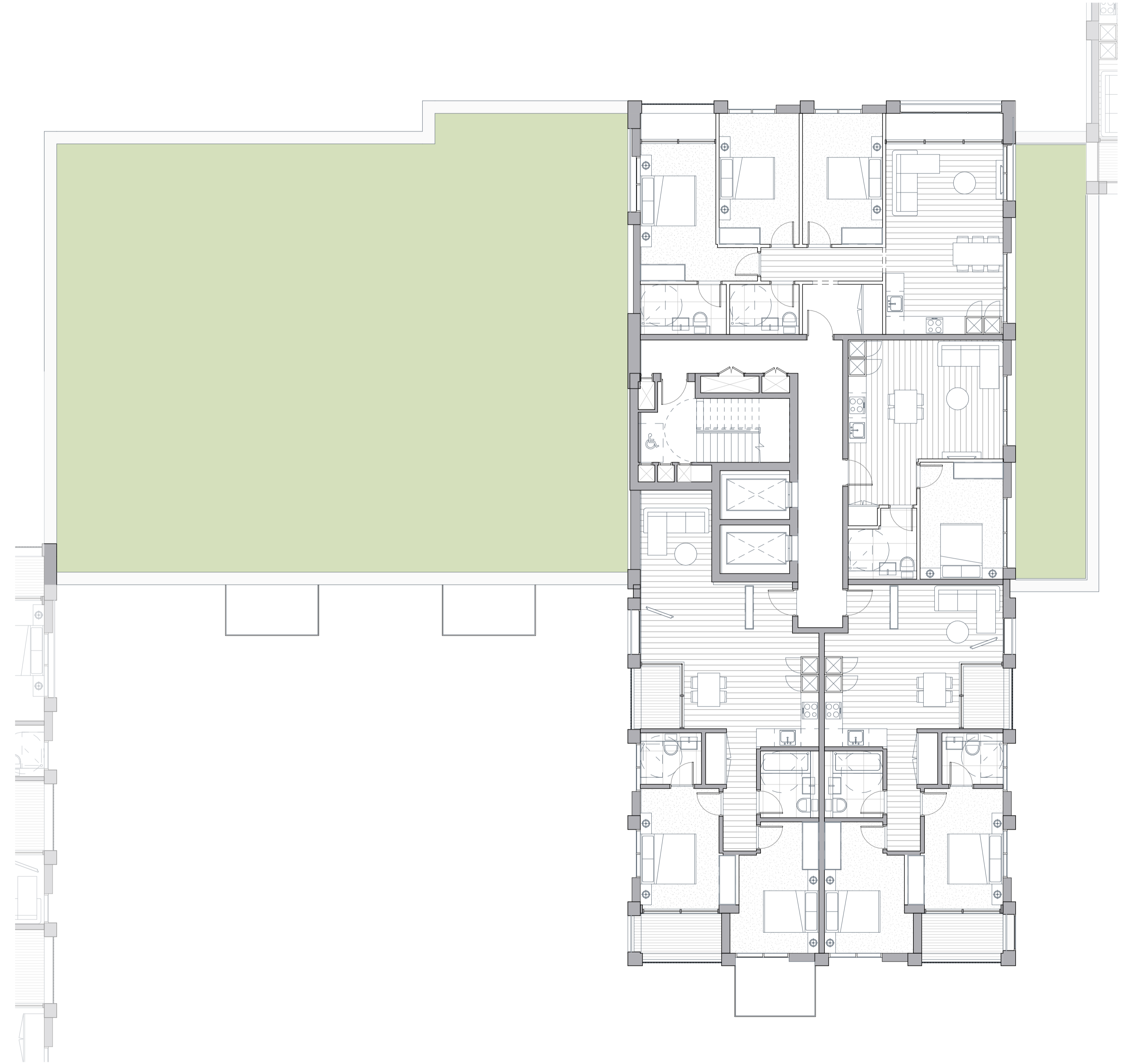
PR-L.05 Block M