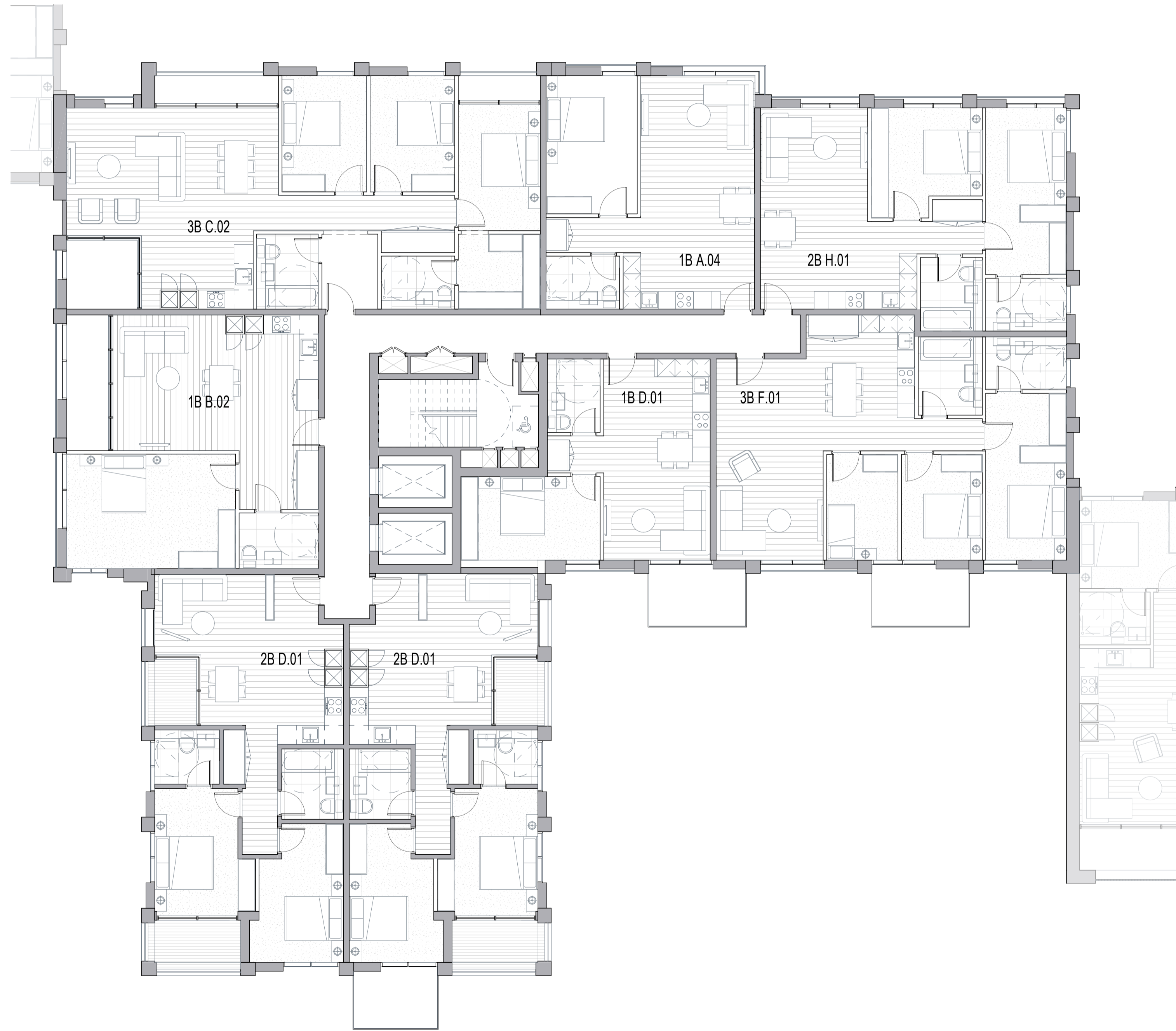
BLOCK D-F-H Typical 1