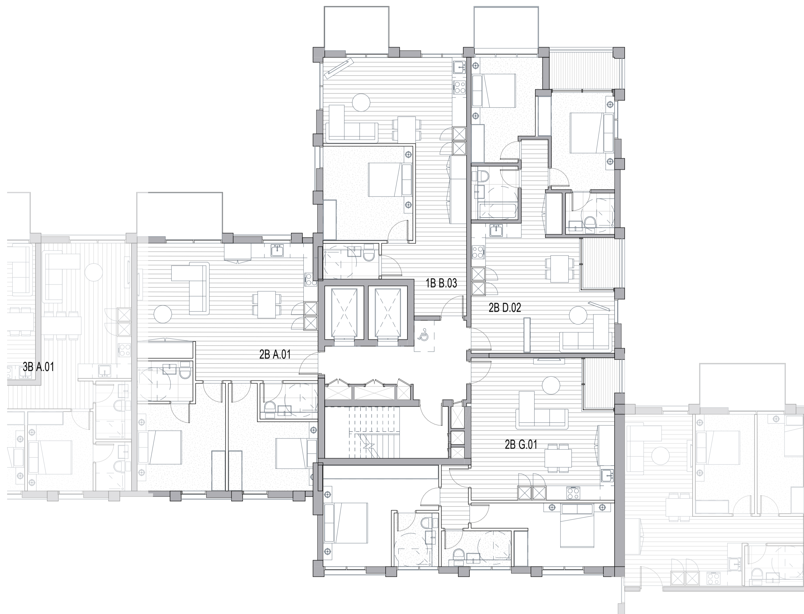
BLOCK I-O Typical 1