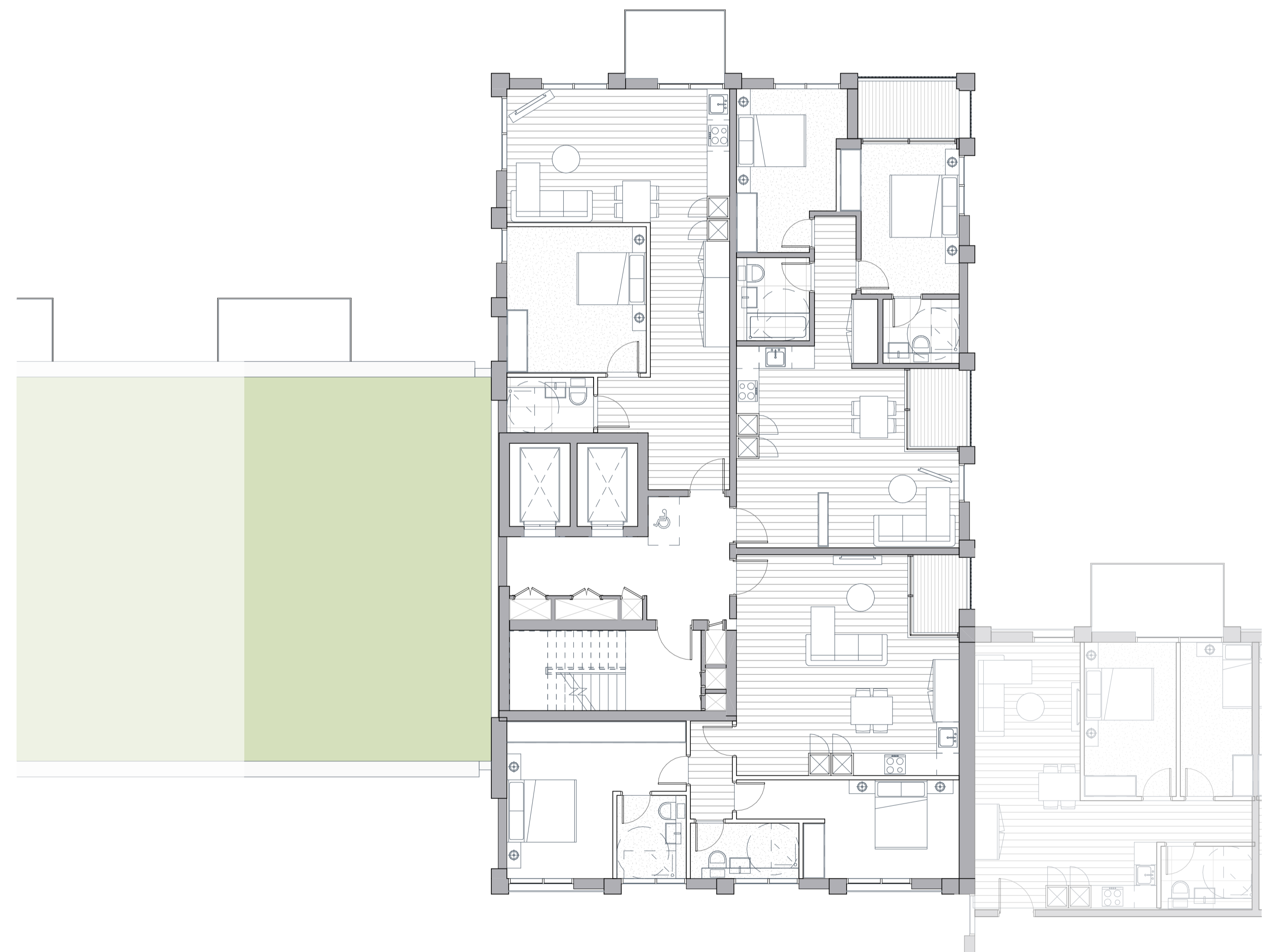
BLOCK I-O Typical 2